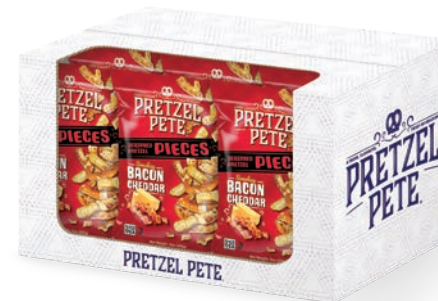
Example of Knock-out Display Case