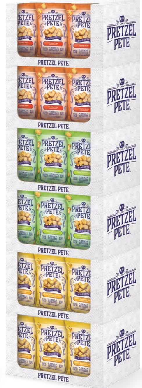
Example of Knock-out Display Case

The seasoning soaks through the shell and into the crevasses of the split in each nugget providing the “wow” flavor. The bite-sized nuggets are perfect when entertaining or as a delicious snack for anyone looking to snack “smart.”