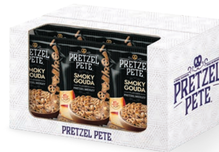
Example of Knock-out Display Case

So, indulge in our Medley Seasoned Pretzels, and treat yourself to the ultimate snack for any occasion.