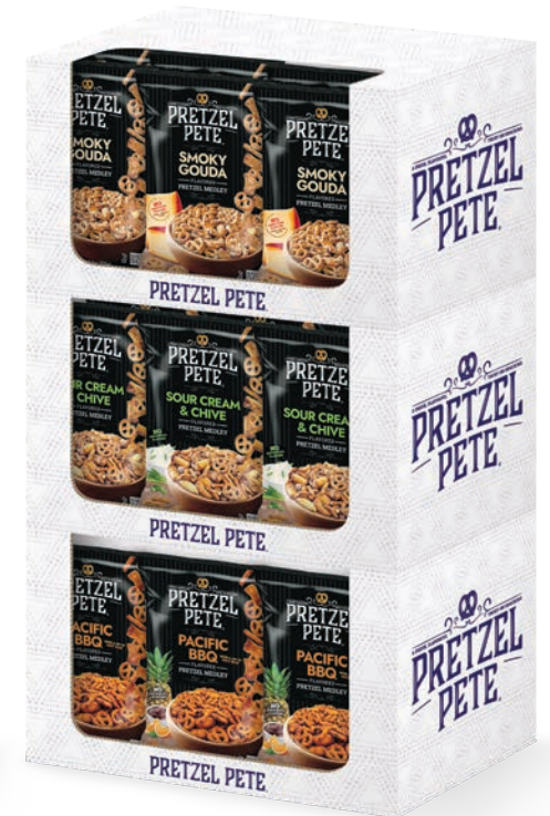
Stackable Display Cases